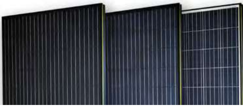
Available in a range of panel power output and styles

The roof covering can be easily maintained or replaced without the cost of dismantling a solar installation. Problems associated with bird infestation are avoided.